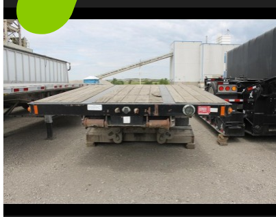
L42261C 2007 FONTAINE LOWBOY